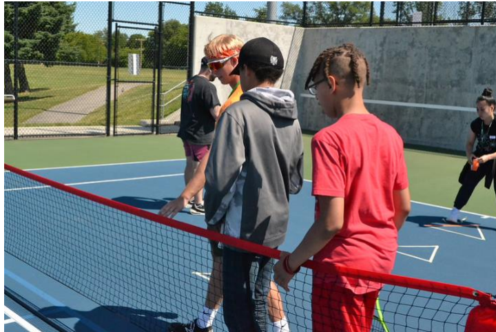
Photo 1.1: Displays a teacher assisting two students to feel the popup tennis net before playing. This is an example of pre-teaching.

Pre-teaching : This needs to occur before the lesson or practice including but not limited to the following information: dimensions of the pitch, equipment, terminology, scoring, strategies, and positions (Lieberman et al., 2013). For BLV tennis pre-teaching should include orienting the athlete to the lines on the court, equipment, rules, and adaptations available.