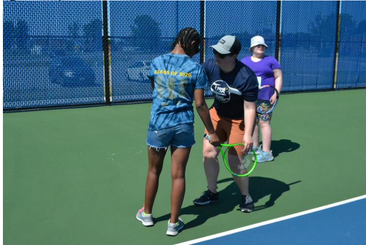
Photo 3.1: Displays a teacher assisting a student in feeling the swing path for a forehand strike, this is an example of physical guidance.

Physical Guidance : This is an instructional strategy where the instructor helps guide the athlete through the movement being taught, such as a forehand in Photo 2.1 (Lieberman et al., 2013). In BLV tennis the instructor should assist the athlete move through a motion and supplement with verbal instruction (e.g., teaching cues).