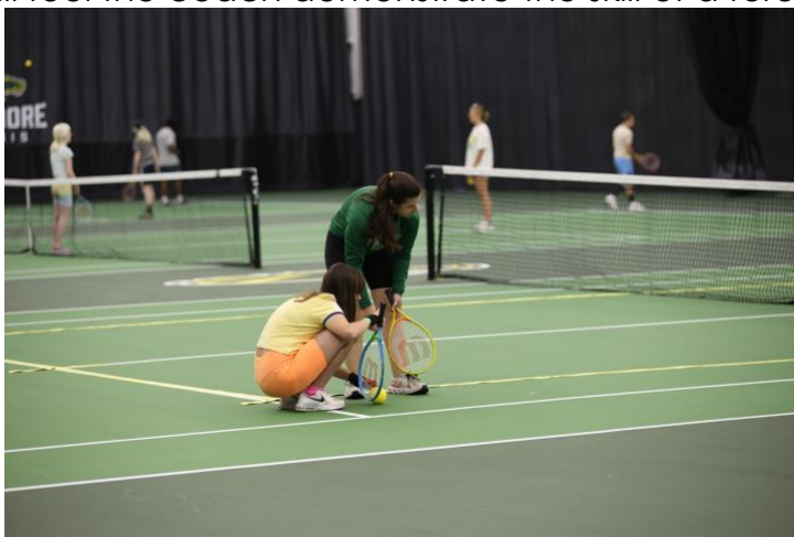
Photo 3.1: Displays a teacher assisting a student in feeling the instructor's stance for a forehand stroke, this is an example of tactile modeling.

Tactile Modeling : This is a instructional strategy used as a demonstration, accessible by touch to BLV players (Lieberman et al., 2013). For example, the athlete will feel the coach demonstrate the skill of a forehand strike.