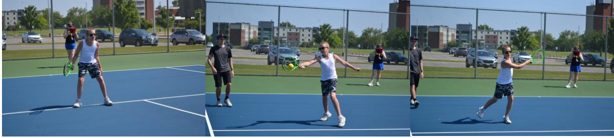
Photo 4.1: Displays a student in ready position for forehand strike.