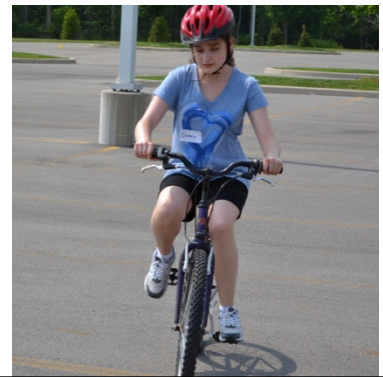
Single bike for the first time: I am rockin' this!