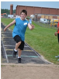
Running Long Jump