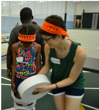
Minute to Win It!