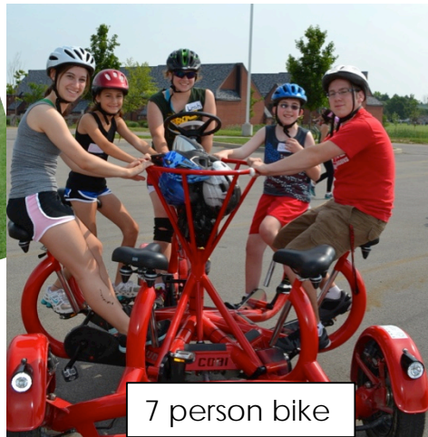
7 person bike